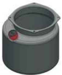
VERTICAL (V) (TIPO D)